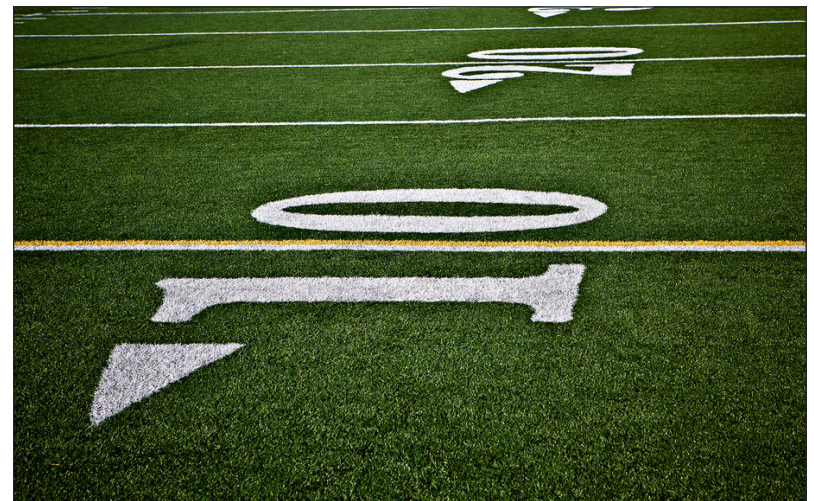
That equates to the length of either 440 football fields, 3,960 transit buses or 10,560 cars!

Approximately 158,405 feet of new rail tracks will be installed from New Haven to Windsor.