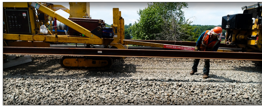
Track Construction Machine laying new track in Berlin