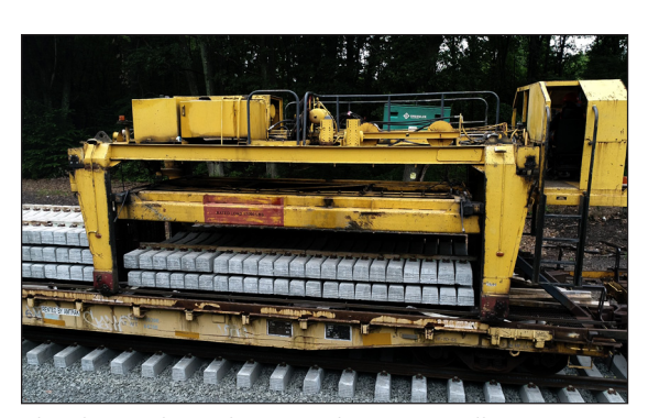
The photos above showcase the TCM installing new track in Berlin

The Track Construction Machine (TCM), which debuted in October 2016 to double-track portions of the New Haven-Hartford-Springfield (NHHS) rail corridor, returned this summer to install nine additional miles of track in the Newington and Berlin area. It will return this fall to install the remaining four miles of track between Hartford and Windsor.